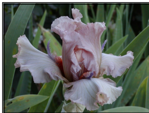
Corps de Ballet